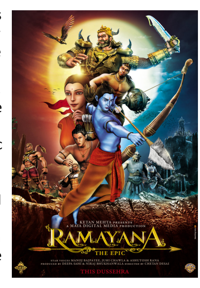
Many Hindu Epics have been animated or made into TV serials as a contemporary means of telling the stories and teaching values in an engaging and entertaining fashion.

Mahabharata: With over 100,000 verses, the Mahabharat is a historical epic, and is the longest poem the world has known. It is seven times the combined length of Homer's Iliad and Odyssey. Based on an extended conflict between two branches of the Kaurava family, the Mahabharata is a trove of stories and discourses on the practice of Dharma . As a scripture, its primary messages are the importance of truth, justice, self sacrifice, and the upholding of Dharma , the need for complete devotion to God, and the ultimate futility of war. Embedded in the Mahabharata is a text of special scriptural significance -- the Bhagavad Gita .