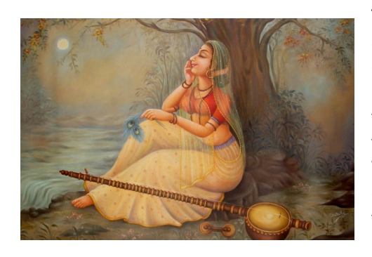
Mirabai was a Rajasthani princess in the 16th century, who became one of the most prolific and well known bhakti saints of that time.

Bhakti Texts: From ancient to contemporary times the teachings, poems, and songs composed by saints in regional languages have been a major source of inspiration. They convey simple messages of devotion, dharma, and spiritual practice through the language of the local people throughout all parts of India and beyond