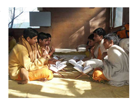
Students learning the Vedas in both the traditional oral tradition and with books.

Vedas : The word Veda means "knowledge". There are four Vedas : Rig, Sama, Yajur and Atharva , of which the Rig Veda is the oldest. It has over 10,000 mantras that deal with a wide range of topics. Some Hindus see the Vedas as texts expounding on rituals and Gods, whereas others see them as teaching metaphysical and spiritual truths about God and the soul. While there is general agreement that the Vedas are at least over three thousand years old, there is little agreement on just how old they are. Evidence is scarce and estimates of their age vary widely, from 1200 BCE to thousands of years earlier than that.